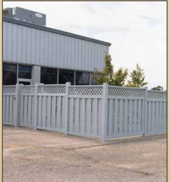
Melbourne® (Gray With Lattice)