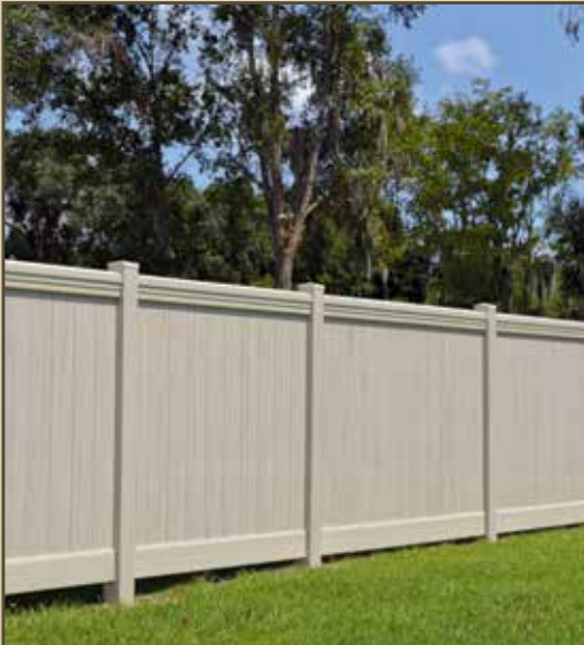
Lakeland® (Streaked with Maxwell Rail)