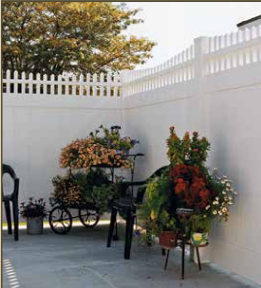
Montauk® Point (Scalloped)