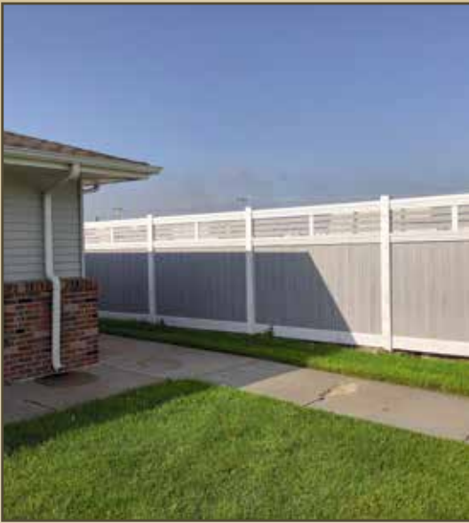
Whitland™ (White and Gray Streaked)