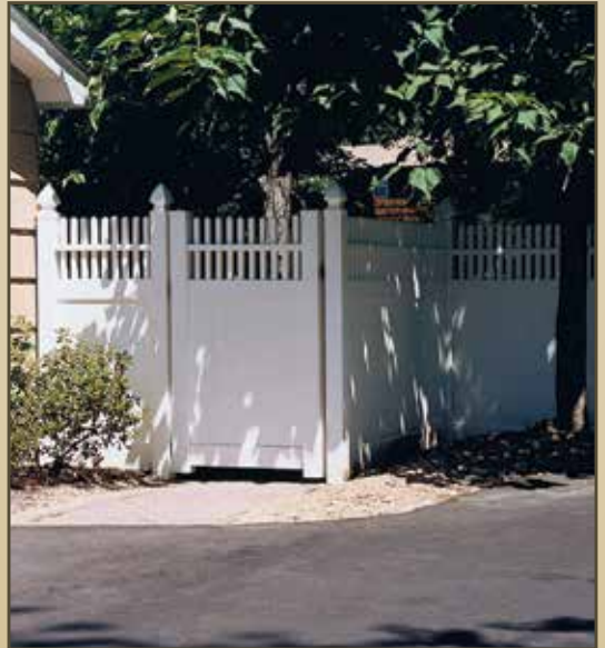
Montauk® Point (Straight)