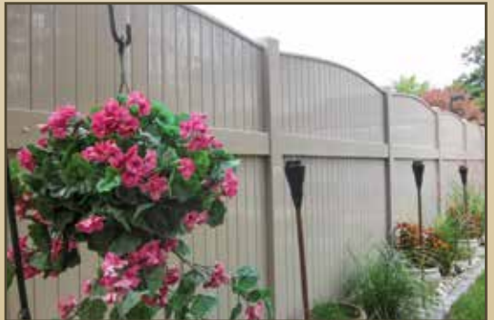
Lakeland® (Convex) (Almond With Spider Board)