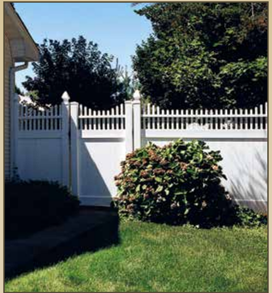
Montauk® Point (Step)